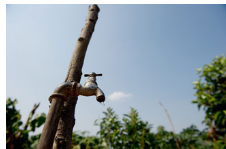
A precious resource: Few challenges related to sustainability are as pressing as the need for clean water and sanitation. In countries such as China, Cambodia and Vietnam, NTU-driven programmes are making real inroads in assisting local communities.