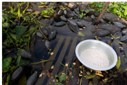
Ground issues: Economic development has placed enormous pressure on Vietnam's water resources. Some of the challenges there faced by Lien Aid stem from the development process itself, with industrial run-off sometimes polluting local sources of water. As a result, riverside communities often rely on unclean water for drinking, cooking and washing.