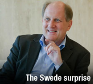
The Swede surprise