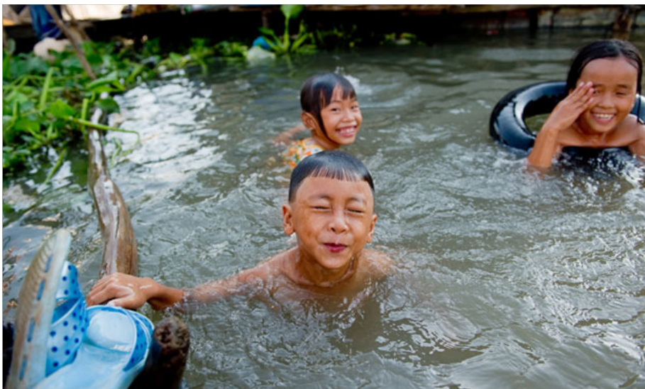
The long haul: Lien Aid's experience in Vietnam and beyond has shown that the management of water and sanitation resources has to be addressed at all levels. It's a mission that this NTU-supported organisation is committed to, for the future of Asia's youth.

Visit www.lienaid.org and www.childrenofmekong.org for more on this project.