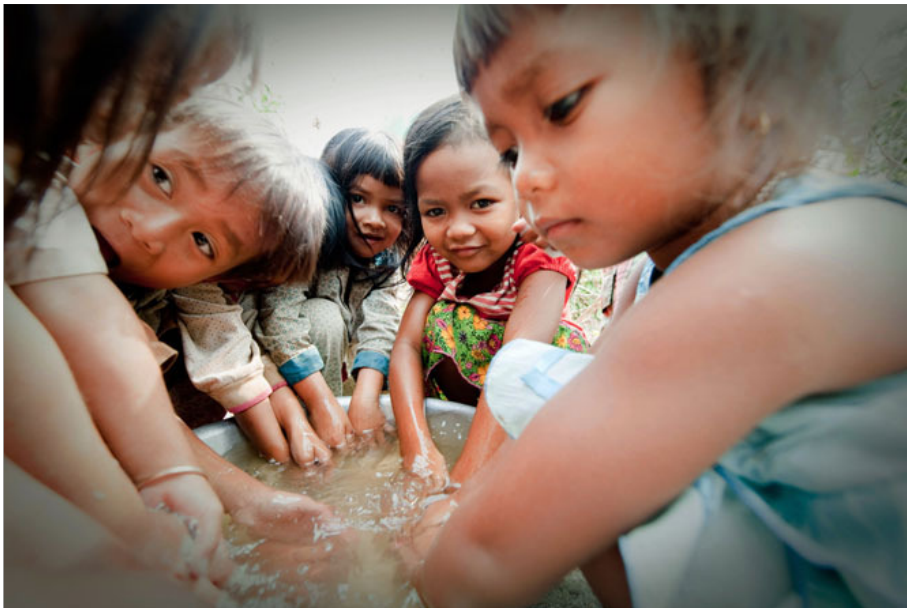
Starting young: Another country in which the Mekong plays a critical role is Cambodia, where thousands live in floating villages along the river. Lien Aid is actively involved in public education campaigns to promote better habits related to water. Here, children attending this kindergarten in Kampong Speu province are taught to wash their hands after playtime.

bodies, private companies and NGOs – to share resources and bring about systemic change.