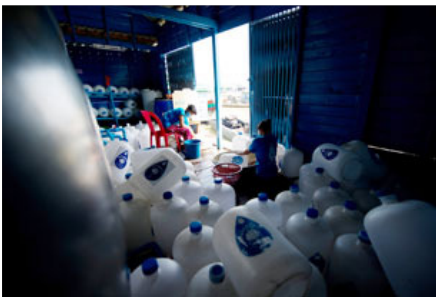
Local empowerment: With two-thirds of the Cambodian population having no access to clean drinking water, Lien Aid established a water treatment plant to empower riverside communities with this vital asset. Owned by villagers under a social entrepreneurship programme, the plant removes harmful bacteria from river water through ultraviolet radiation.