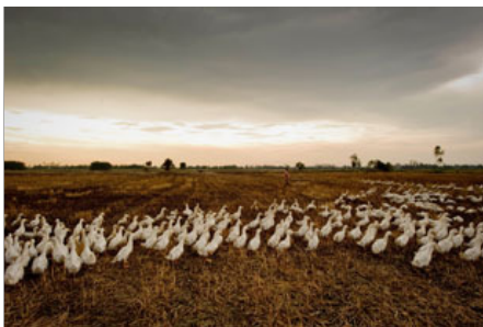
New dawn: A flock of ducks crossing a ricefield in the Mekong Delta. Since its inception in 2006, Lien Aid has successfully piloted over 40 projects in clean water and sanitation. By documenting its achievements, the media team hopes not only to educate the public, but to inspire others to see how they can also contribute.