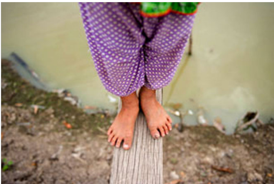
An eye for the essentials: It was the chance to humanise complex issues related to water that drew my collaborators and I to work with Lien Aid. Together, we travelled to numerous Lien Aid project sites over six months.