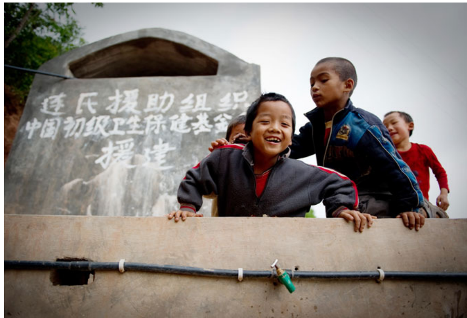
Building blocks: At Zame village in mountainous Yunnan, China, Lien Aid takes a back-to-basics approach: simple, accessible and affordable solutions that address needs on the ground, and which can be sustained by local means. With the support of the China Primary Healthcare Foundation, Lien Aid has brought piped water to the children of Zame Primary School.

Alumni from the Wee Kim Wee School of Communication & Information discover how NTU and the Lien Foundation have brought viable water solutions to communities throughout Asia.